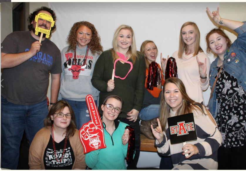
Fall 2018 Fall Fling Drop-in Event to celebrate Middle Level and Elementary interns. This event has become a tradition for the Teacher Education department. It's a fun send-off for our first semester interns and is hosted by faculty. We have book and goodie bag give-aways, lots of finger foods and snacks, and other stations like thank-you card writing and rainy day jars.